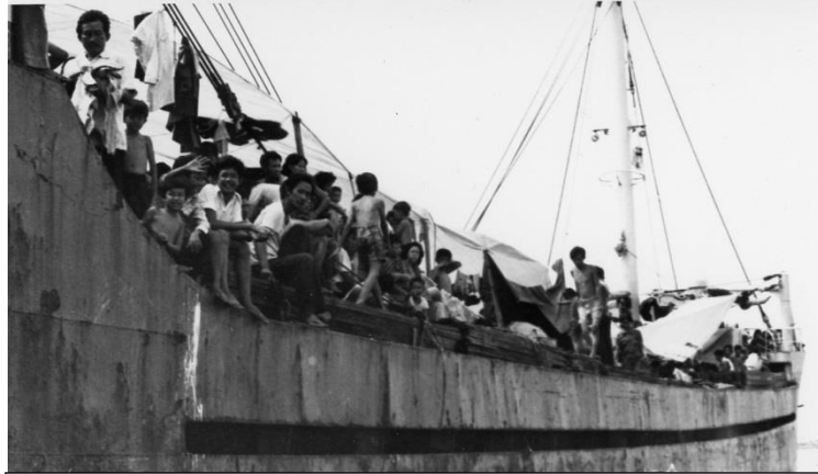
Coming alongside the SS Kua Koon