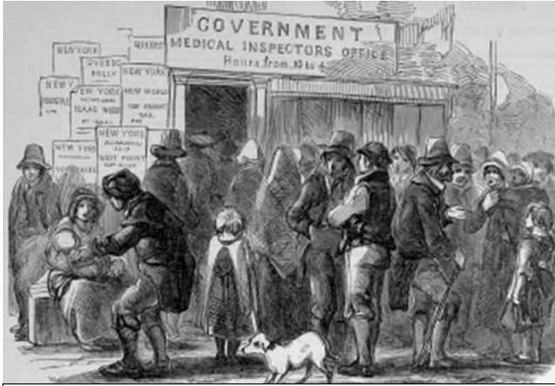
The Government Inspector's Office

epidemics arriving from abroad, civic and municipal ordinances were replaced by colonial and provincial legislation, such as those that followed the cholera outbreaks of the mid-1800s 3 . Individual port of entry or provincial attempts to deal with the spread of cholera arriving with immigrants were consolidated over time and developed into national practices (See Bulletin 76).