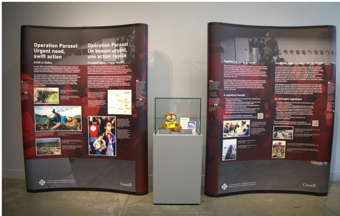
Operation Parasol: Urgent need, swift action, display created by the Canadian Museum of Immigration at Pier 21 to commemorate the evacuation's 25th anniversary.