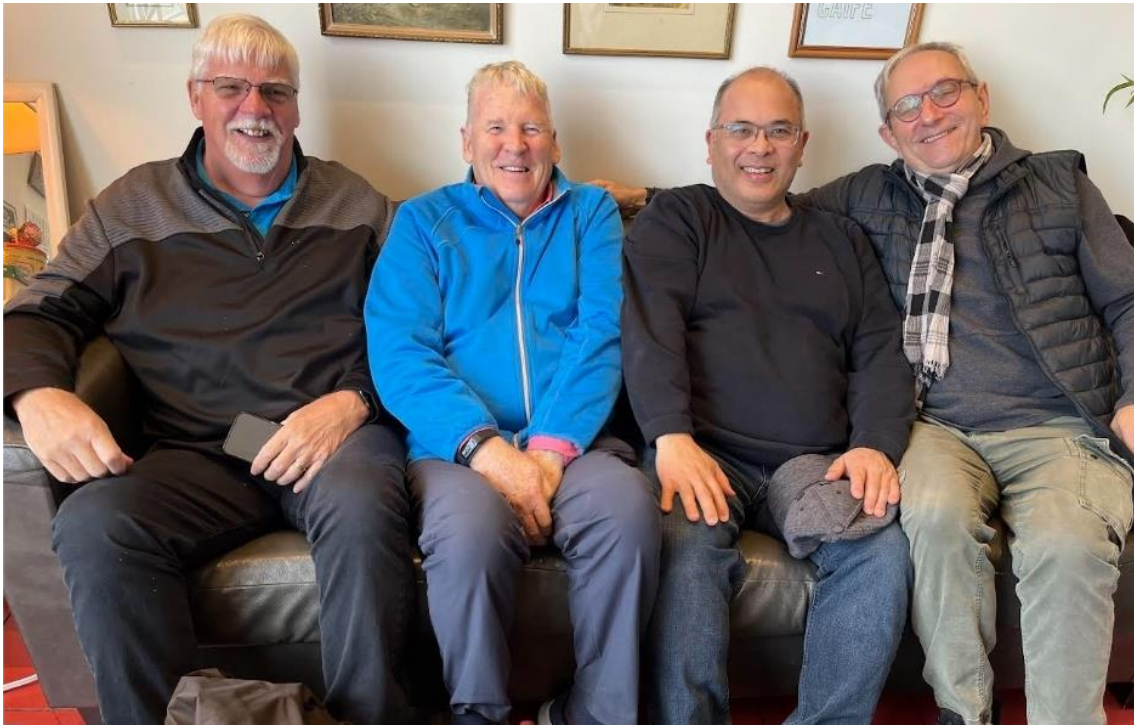
A chance meeting in a Halifax coffee shop in the fall of 2024 led to a sharing of memories amongst former colleagues involved in Operation Parasol in Nova Scotia and New Brunswick.